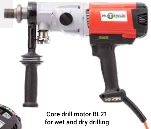
Core drill motor BL21 for wet and dry drilling