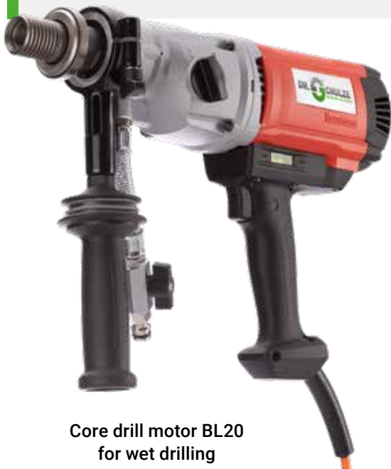
Core drill motor BL20 for wet drilling

The newly integrated kickback stop , an active safety feature, detects dangerous or uncontrolled twisting of the machine and immediately stops the motor. This significantly reduces the risk of injury.